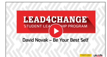
BE YOUR BEST SELF